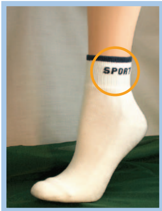
Sports events: for your participants