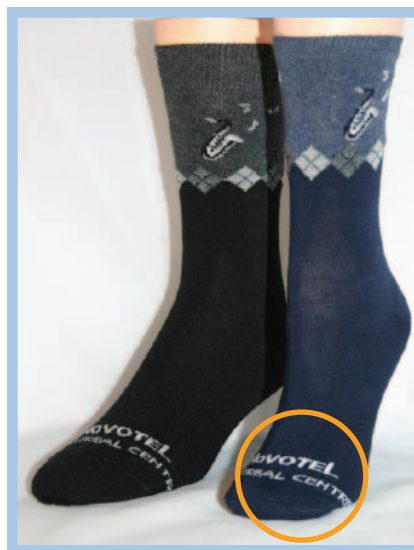
Hotels: for your clients