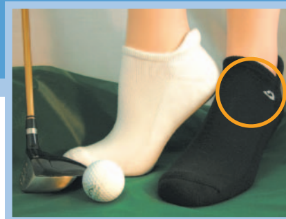
Golf tournaments: for your guests