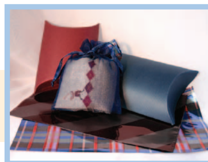
Corporate parties (Christmas, etc.): for your employees