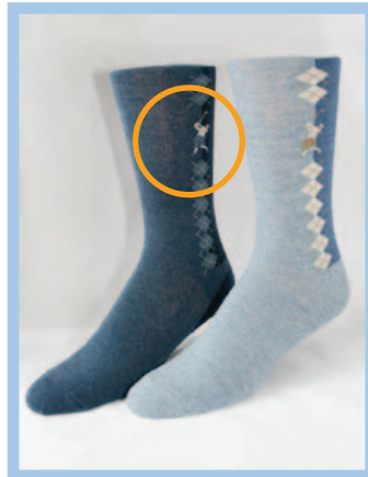
Corporate events: for your guests